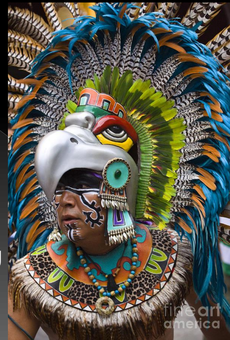
Danzante Azteca representing an eagle warrior.