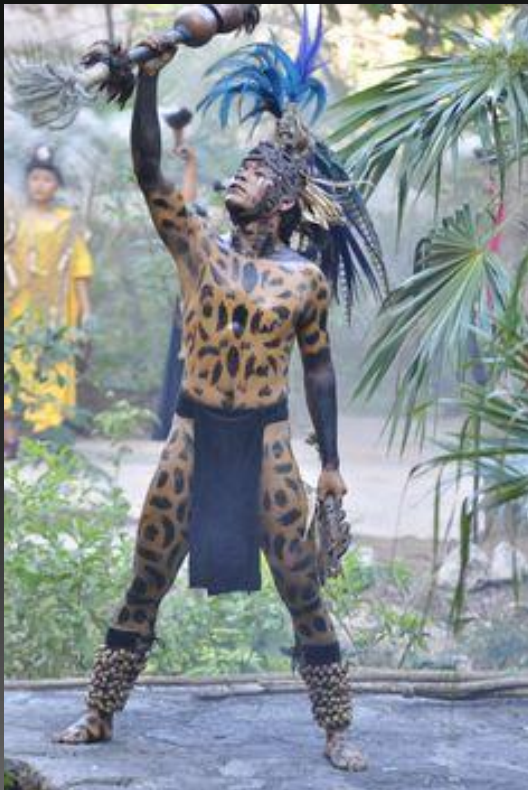
Danzante Azteca representing a jaguar warrior.